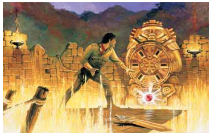
Illustration for the box of Temple Raiders, which was rejected by the board of Hasbro.